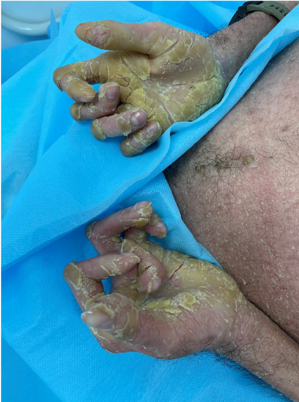
Figure 4: A 24-year-old male patient with EHK showed severe thickening, yellowish hyperkeratosis surrounding the hand's joints and significant disfigurement and flexure contracture of fingers.