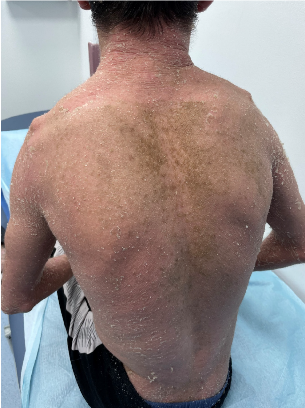
Figure 3: A 24-year-old male patient with EHK showed widespread erythroderma of back with hyperkeratosis (corrugated cardboard-like) dark-brown dry pattern scales.