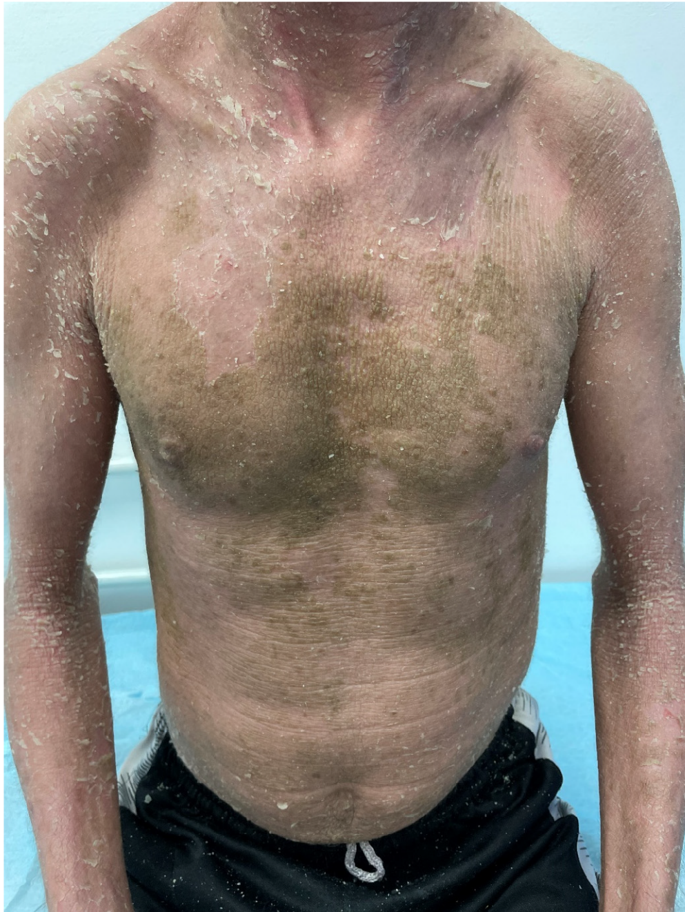
Figure 2: A 24-year-old male patient with EHK showed widespread erythroderma of trunk and flexures with hyperkeratosis (corrugated cardboard-like) dark-brown dry pattern scales.