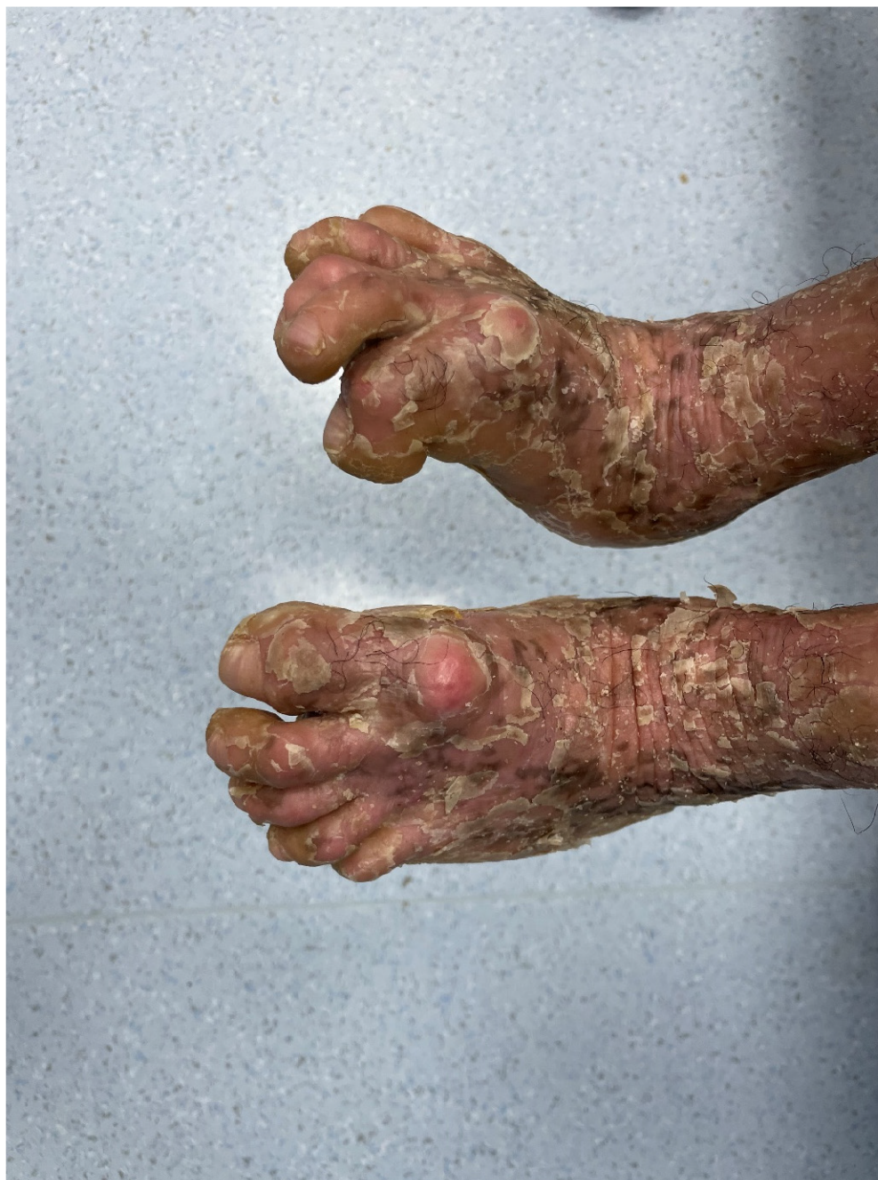
Figure 5: A 24-year-old male patient with EHK showed severe thickening, yellowish hyperkeratosis and significant disfigurement of feet with contractures and toes clawing.